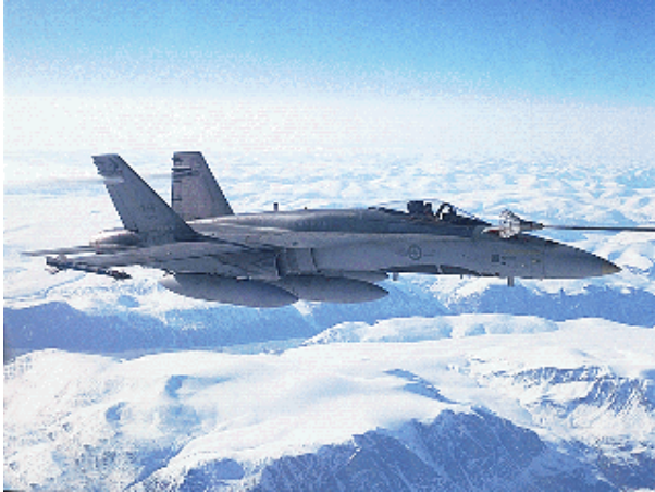
Photo: 2 F18 Hornet using AUTONIC LE for wear and infrared shielding in camera pod

Electroless Nickel Deposits can be classified into four types. These are based on the structure and percent of phosphorus in the coating that in turn controls the deposit performance. These deposits are amorphous as plated and after heat treatment exhibit a mixture of \beta and \gamma phases. Deposits produced by the LX process can be classified as ASTM B733 Type III and essentially are comprised mostly of \beta phase nickel phosphide.